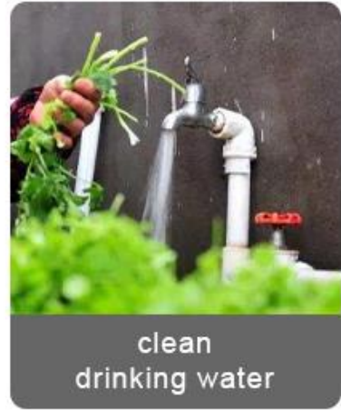
clean drinking water