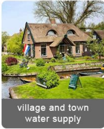
village and town water supply